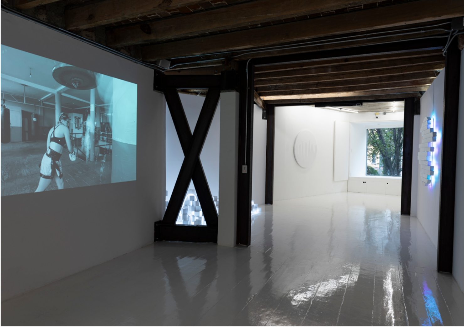
View from the exhibition