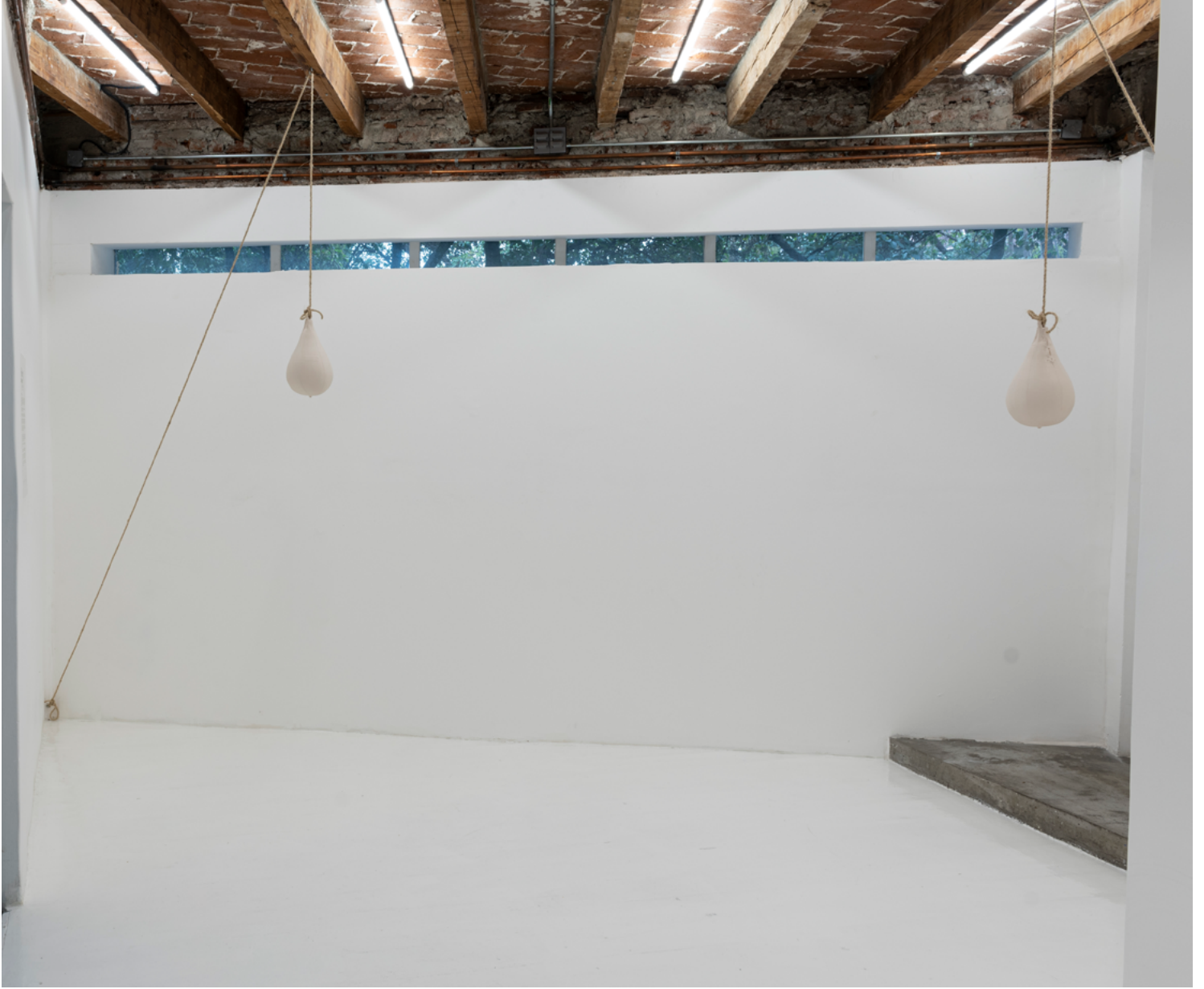
View from the exhibition