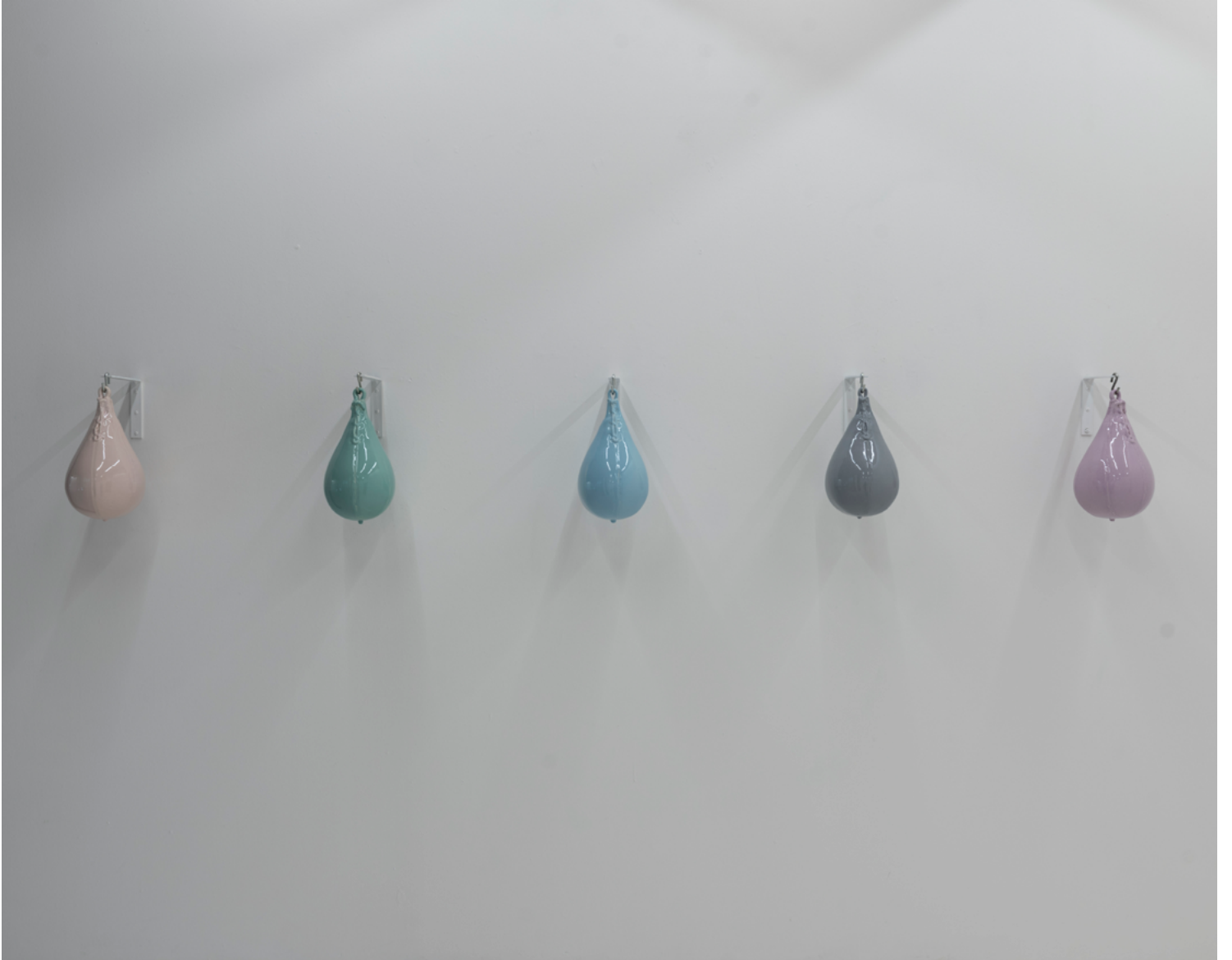
View from the exhibition