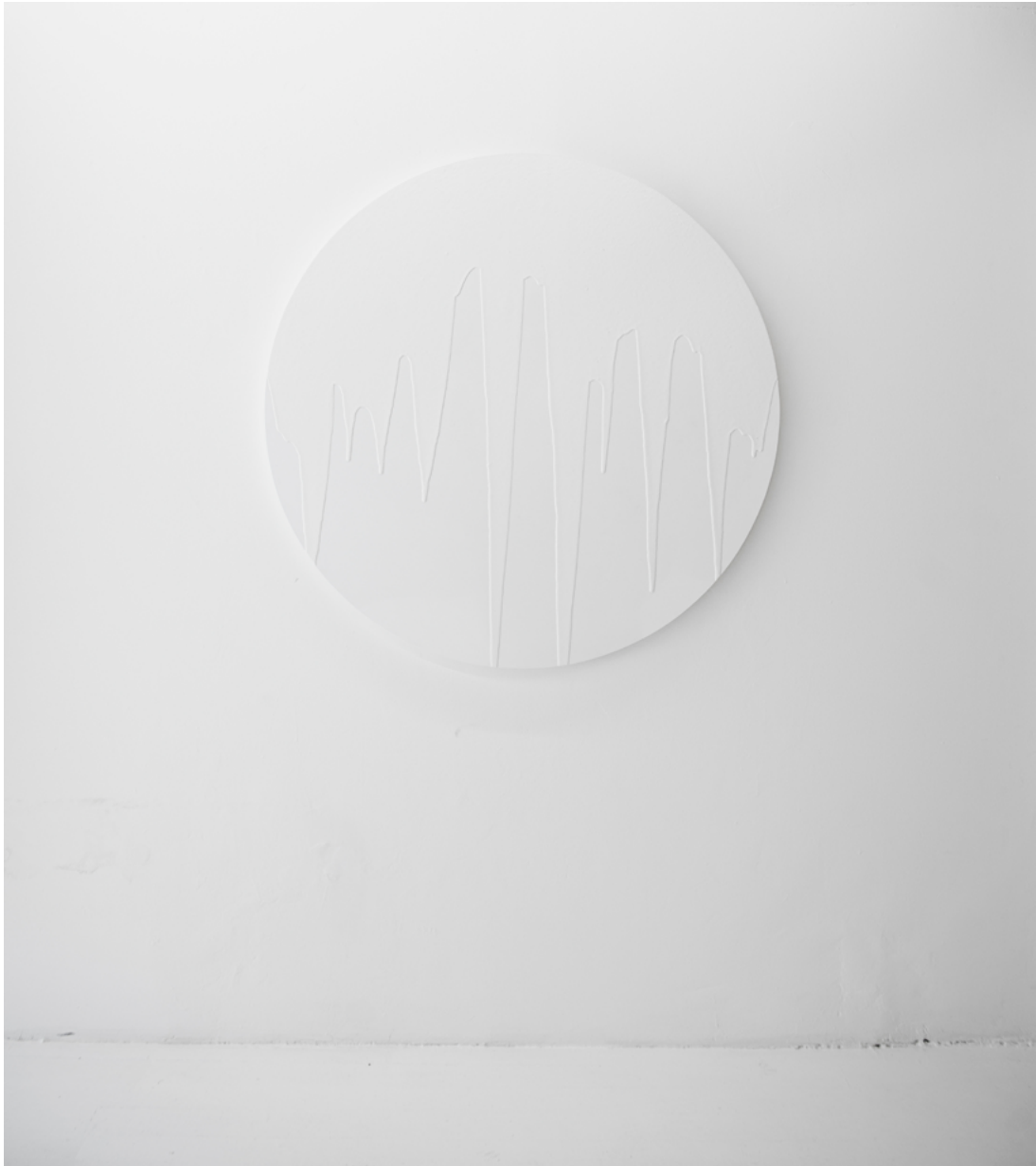
Bianco II Acrylic on Canvas 120 cm diameter (47 in) 2021