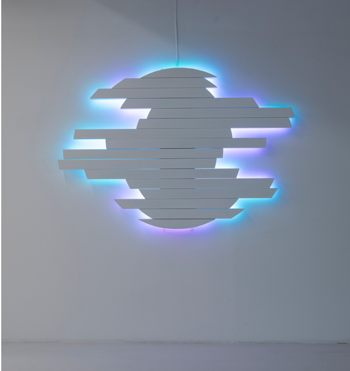
Arcadia (Edition of 3) Mix media 120 cm diameter (47 in) close 200 cm open 2021