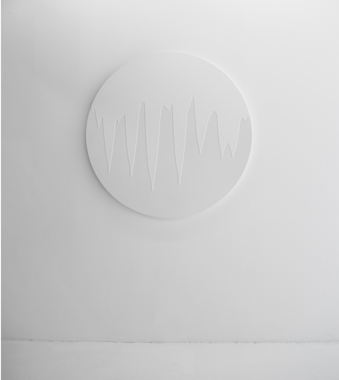
Bianco I Acrylic on Canvas 120 cm diameter (47 in) 2021