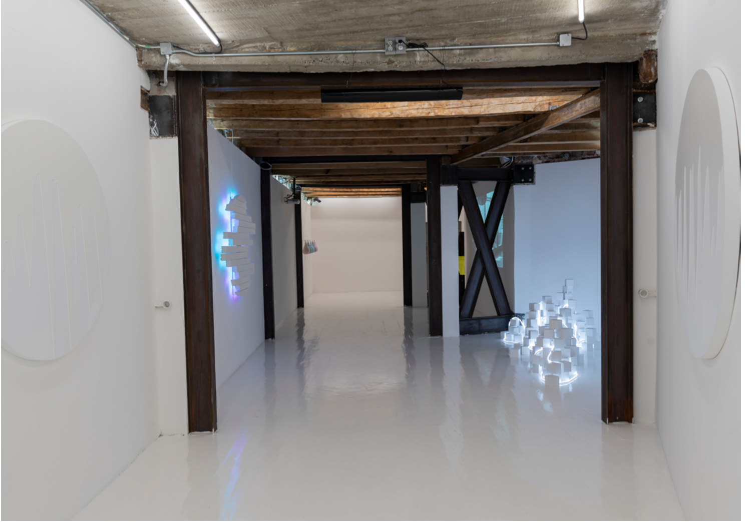
View from the exhibition